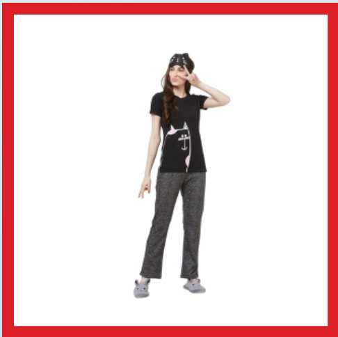
Evolove Womens Pajama T-Shirt Sets (EVO25)