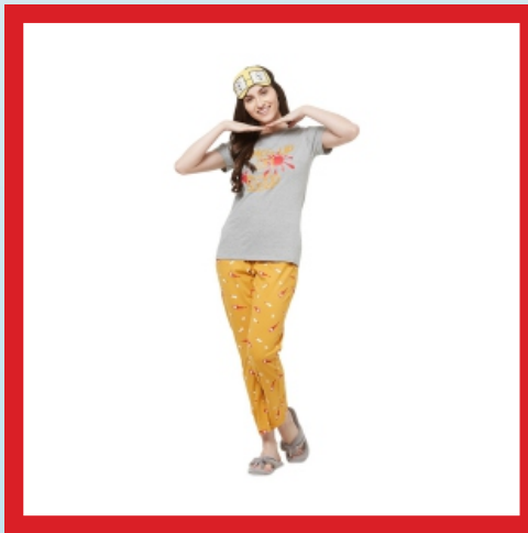
Evolove Womens Printed Pajama T Shirt Sets (EVO26)