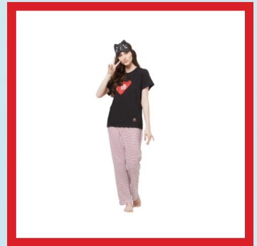
Evolove Womens Printed Pajama T Shirt Sets (EVO3)