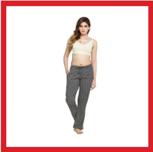
Ladies Fancy Pajama