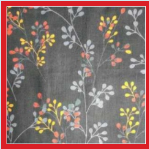
Printed Cotton Fabrics