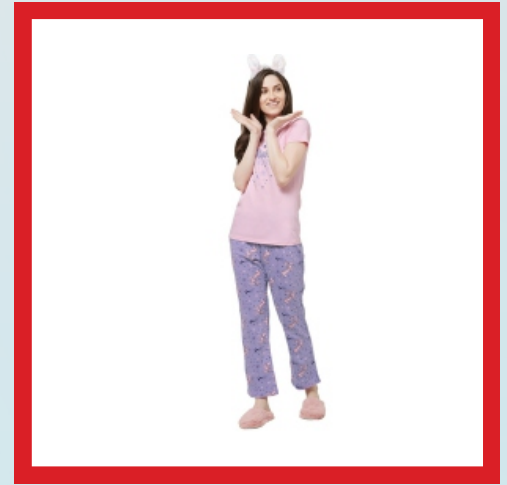
Evolove Womens Pajama T Shirt Sets (EVO23)