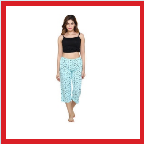
Ladies Nightwear Printed Capri