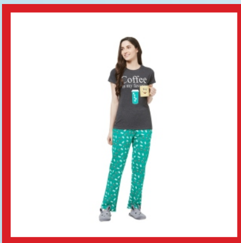
Evolove Womens Pajama T Shirt Sets (EVO24)