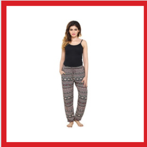
Ladies Rayon Bottom Pajama