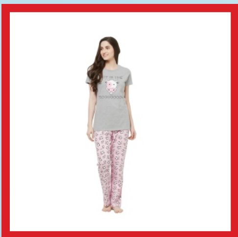
Evolove Womens Pajama T-Shirt Sets (EVO1)