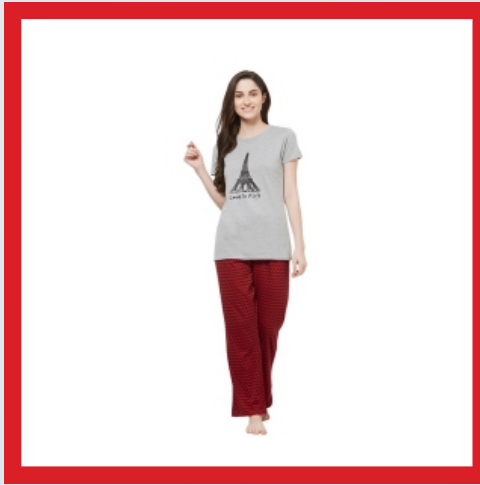
Evolove Womens Printed Pajama T Shirt Sets (EVO2)