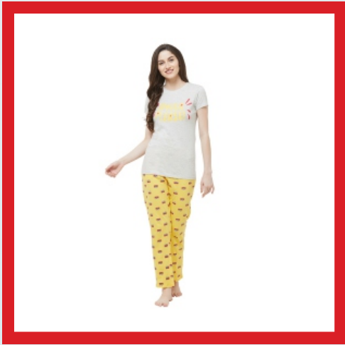
Evolove Womens Printed Pajama T Shirt Sets (EVO27)