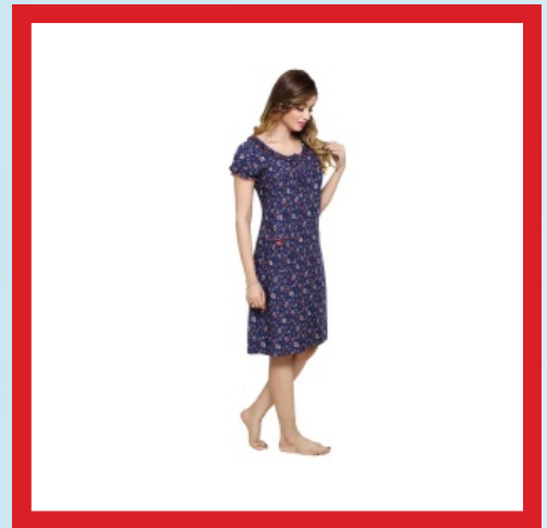
Pdpm Ladies Rayon Printed Nighty Short Nighty