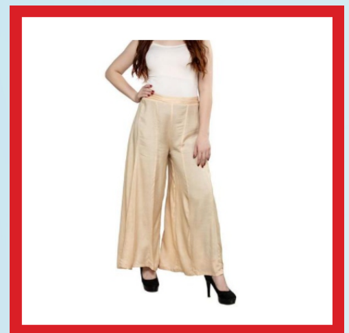
12 Kali Shimmer Palazzo